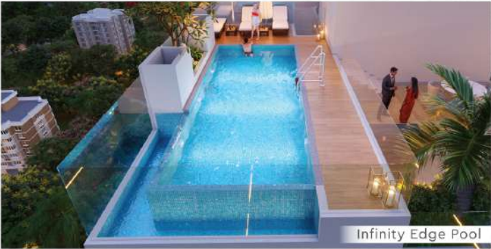
Infinity Edge Pool